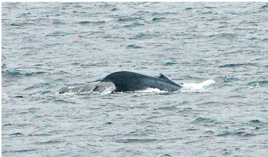
Fig. 2. Examples of a blue whale sighted during the geophysical survey offshore southern Sri Lanka.

region of nutrient rich water and strong upwelling (de Vos et al. , 2014a). This region represents a rare habitat type with a narrow continental shelf and a steep concave slope. The presence of the Dondra submarine canyon and seasonally reversing monsoons, converging ocean currents and strong trade winds also contribute to the special environmental conditions resulting in high productivity (de Vos et al. , 2014b). Due to their high energetic demand, blue whales are known to aggregate in areas of upwelling events or frontal systems with an abundance of prey (Alling et al. , 1991;