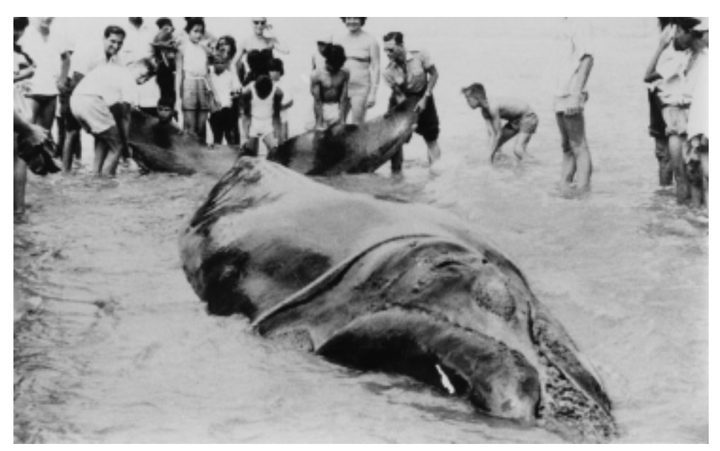
Fig. 2. A juvenile southern right whale stranded at Itanhaém (24°10'S, 46°45'S), São Paulo, on 27 January 1955.