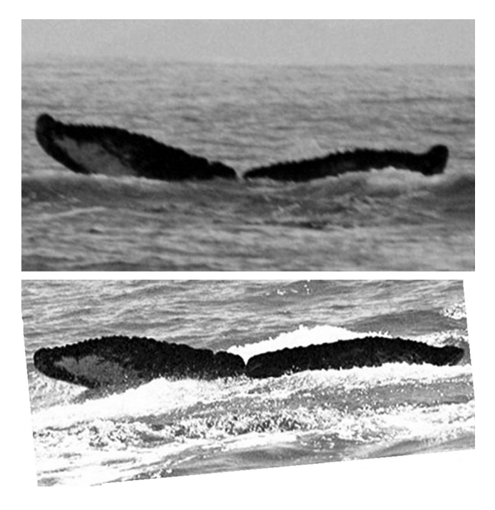
Fig. 1. AHWC#0664 photographed off Salinas, Ecuador in 1996 accompanied by a calf of the year (top) and on Abrolhos Bank, Brazil in 1998 (bottom).

While it is not clear what physical or social cues humpback whales use to identify breeding habitat, nor how they navigate, they are able to follow remarkably direct