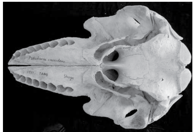
Fig. 6. Skull of a false killer whale. Nine round tooth sockets arranged along full length of rostrum, wide premaxilla bones and deep antorbital notches aided the identification of this specimen.

Records suggest that the false killer whale is a breeding resident in the Gulf of Oman (Baldwin et al. , 1999; Leatherwood et al. , 1991). A sighting reported by Leatherwood et al. (1991) at 25.85°N 59.85°E is incorrectly located 30 miles inland in Iran, however the sighting itself may still be valid. One false killer whale skull stored at IFRO in Chabahar (Fig. 6), and collected from the nearby coast, suggest it is present in Iranian waters of the Gulf of Oman.