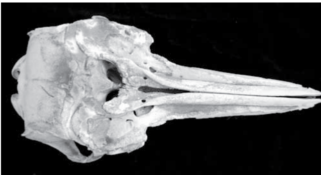
Fig. 4. Skull of rough-toothed dolphin, stored in the IFRO museum in Chabahar. The skull was identified based on the large orbit, number of teeth and the ridge at the ventral side of the frontals.

The complete skull of a mature rough-toothed dolphin is stored at the IFRO office in Chabahar (Fig. 4). This is the first, and only, record of this species in Iran. This species has not been recorded in Pakistan but it has been recorded (both sightings and strandings) a hand-ful of times in Omani waters of the Gulf of Oman (Ballance and Pitman, 1998; Van Waerebeek et al. , 1999; Oman Whale and Dolphin Research Group, unpublished data). There is no evidence of rough-toothed dolphin occurrence in the Persian Gulf and it is unlikely that this is suitable habitat for this deep water species (Robineau, 1998).