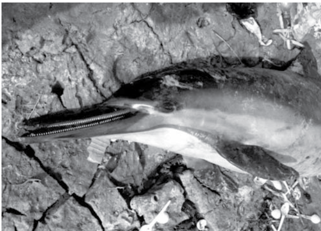
Fig. 3. Long-beaked common dolphin, D. c. tropicalis , stranded near Bushehr. The extremely long rostrum, high tooth count, flipper to jaw stripe and hourglass pattern on the flanks are diagnostic.

In Iranian waters of the Persian Gulf, one group of 12 common dolphins were recorded in offshore waters in the northwest (Henningsen and Constantine, 1992). No specific location for this sighting was given, but the survey track indicates that the sighting must have been SSW of either Bushehr city, or Ganaveh. A young bycaught animal stranded near Bushehr city in November 2007, and two animals, a 203cm male (Fig. 3) and 186cm female, were bycaught near Ameri, Bushehr in February 2008 (Table 1). A D.c. tropicalis skull is stored at the GeoPark Museum on Qeshm Island.