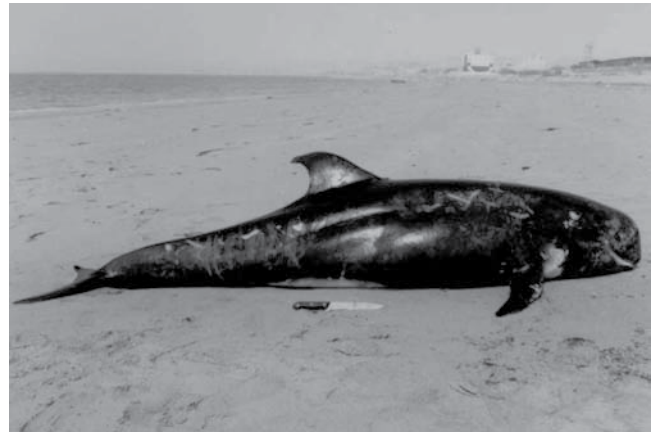
Fig. 5. Stranded Risso's dolphin, close to Chabahar. This species is identified based on the white patch on the chest, white lips, blunt head, dark colouration with white scarring and tall falcate dorsal fin.

Knowledge of this species in the northwest Indian Ocean is very limited and although there is a well documented record from Hallaniyah, Oman, there are no confirmed sightings in the Persian Gulf or Gulf of Oman (Baldwin et al. , 1999; Van Waerebeek et al. , 1999). The ease of confusion with other