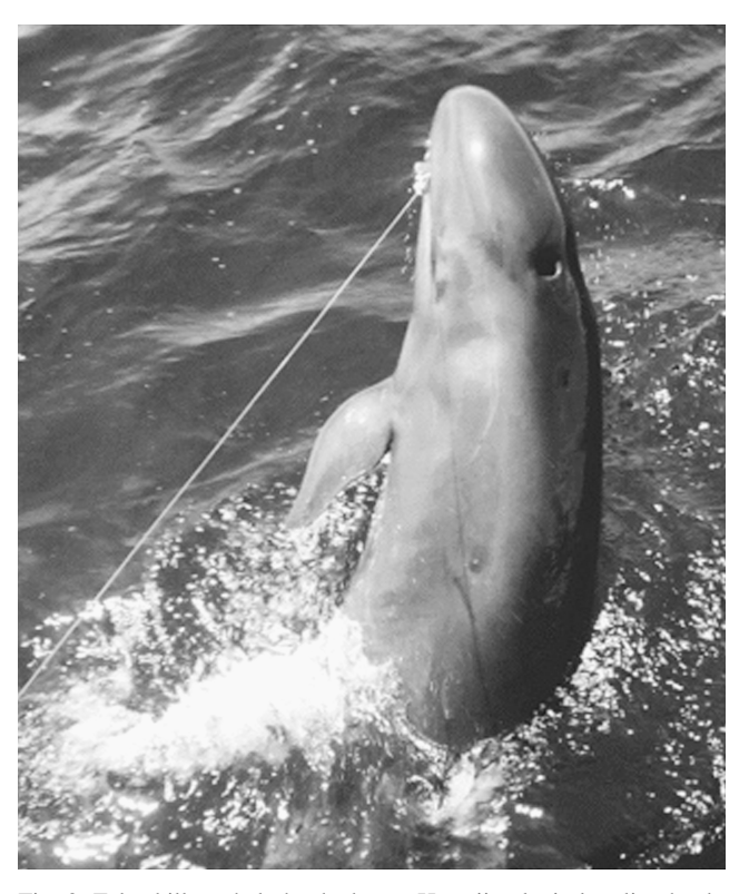
Fig. 2. False killer whale hooked on a Hawaii pelagic longline hook. The linear mark on the side of the whale might be an abrasion from contact with a main or branch line.

Cetacean-longline interactions have been observed from as early as 1952 in the Japanese longline tuna fleet (Nishida and Shiba, 2002). Most cetacean-longline interactions are thought to be the result of odontocetes being attracted to the fishing gear or boat because of opportunities to remove bait or caught fish; this may occasionally (e.g. Northridge, 1984; Ashford et al., 1996; Dawson et al., 1998; Waring et al., 1999; Baird et al., 2002; Forney, 2004; Baird and Gorgone, 2005) also result in entanglement or hooking, injury and mortality of the cetaceans (Fig. 2). Odontocetes are thought to develop familiarity with the sounds of longline boats (including the engine, gear haulers, depth sounders and radio buoys) and target the catch and bait after homing in on the vessel or its gear. There is anecdotal evidence that some resident cetaceans can home-in on specific vessels, even singling out one vessel to target when several are fishing in the same area (e.g. Australian Fisheries Management Authority, 2005). Other observed cetacean behaviour includes following longline boats to gear that has been set soaking and waiting by buoys for the vessel to arrive and haul (Ashford et al., 1996; Australian Fisheries Management Authority, 2005). The incidental entanglement and hooking of baleen whales has also occasionally been reported in longline gear (e.g. Bowman et al., 1999; Forney, 2004), probably as a result of their swimming paths accidentally crossing gear.