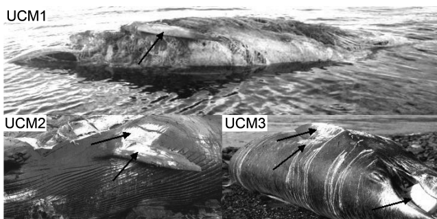
Fig. 2. Individual dwarf minke whales stranded at Navarino Island. UCM 1 shows a white patch on the flipper; UCM 2 shows a white patch on the flipper and white shoulder; UCM 3 shows a white patch on the flipper, white shoulder and white pattern of coloration of baleen plates.

The results of this study suggest that both Antarctic and dwarf minke whales occur in the Patagonia Channel in summer and early autumn. One of the questions to be resolved is the location of the wintering grounds for these animals. Minke whales are rarely observed in the eastern South Pacific, but they are commonly observed in the western South Atlantic. This is similar to the situation in southern Africa where they are rare off southwestern Africa but are common off southeastern Africa (Williamson, 1975). Both species occur in the wintering ground off Brazil, indicating a degree of overlapping in their distributions (Zerbini et al. , 1996), but the dwarf minke whale is more commonly observed near the coast, as has also been